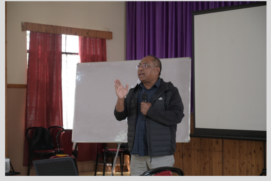
A one-day interaction with traders from various value chains was held on 15th October 2024 at Lumjingshai, Pohkseh, East Khasi Hills District. The program focused on addressing the challenges traders face in their business operations, marketing strategies, and exploring solutions for more efficient market operations.